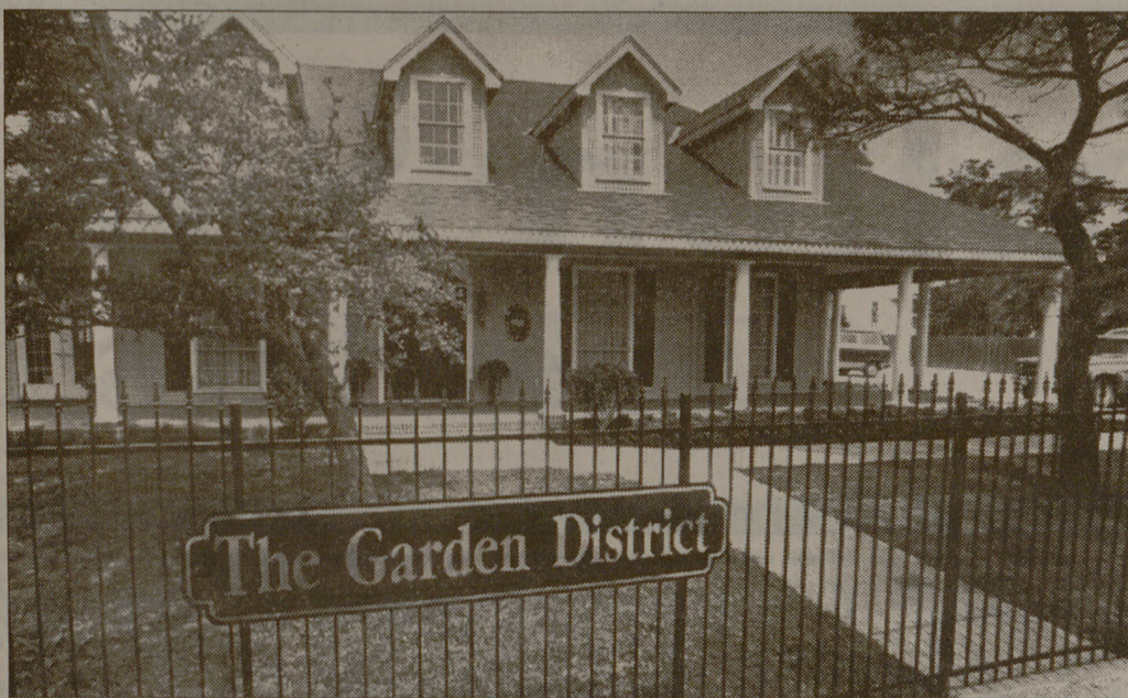
The Garden District, located a few blocks from campus, was founded in 1983 and is quickly becoming one of the area's hottest tourist attractions.