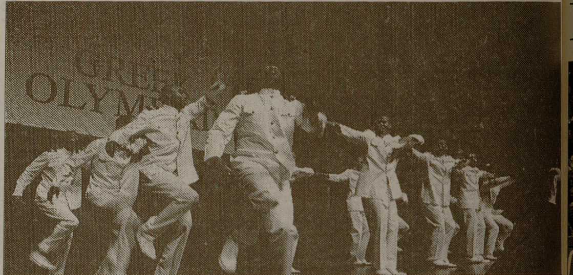
Members of the UH chapter of Alpha Phi Alpha fraternity perform a part of their step sequence that helped them win first place in the Sixth Annual Greek Olympiad. The Olympiad was held Saturday night in Rudder Auditorium for a crowd of over 800.