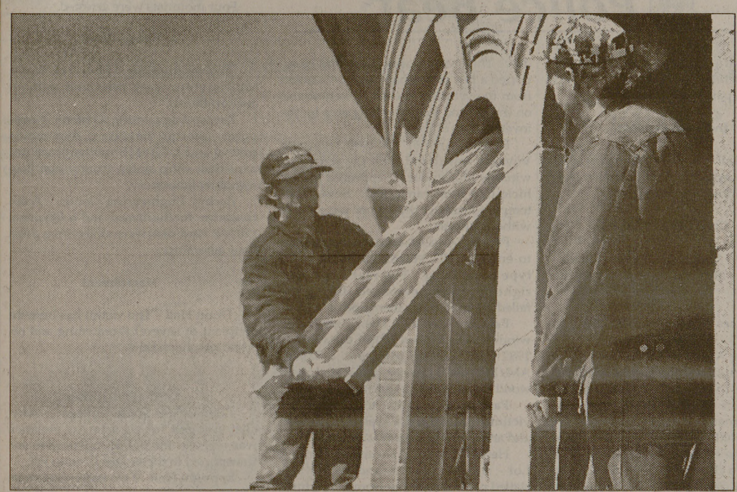
Physical plant workers replace windows on the dome of the Academic Building