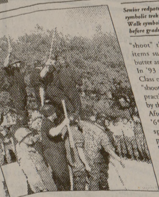
Senior redpots gather at Fish Pond on their symbolic walk through campus. Elephant Walk symbolizes their final days together before graduation.

SENIORS WALK LINE OF DEAD ELEPHANTS Class of '95 occupies juniors to clean up tradition.