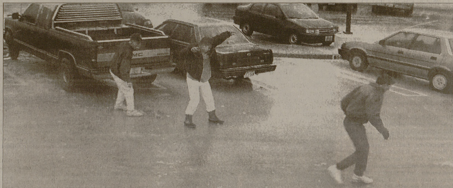
Northside residents enjoy the effects of the below freezing weather as they slide down the ramp of the fifth floor of the north gate