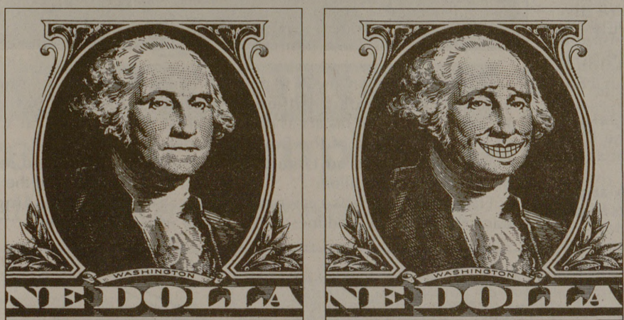
No known picture of Washington smiling exists. Economists believe Washington was unhappy because he felt he could have received a better deal on war supplies. If he used a Citibank Classic Visa card, he would have been assured of getting the best price and probably would have been happier. (Artist's rendering of how he would have appeared on the dollar)

You can capitalize on a $20 Airfare Discount for domestic flights 1 , a low variable interest rate of