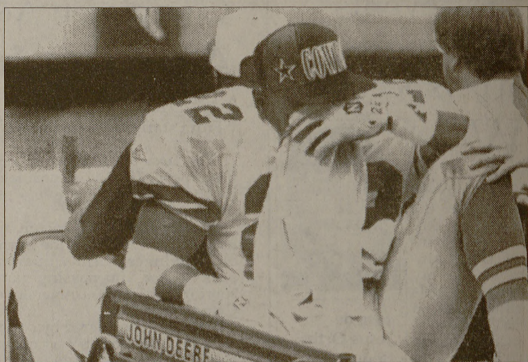
The NFL's leading rusher, Cowboy's running back Emmitt Smith, is carted off the field after separating his shoulder against the N.Y. Giants. Smith leads Dallas against the San Francisco 49ers in Sunday's NFC championship game at Texas stadium.

"I told them it would be to their benefit to be as selfish as they can be. It's the best way to