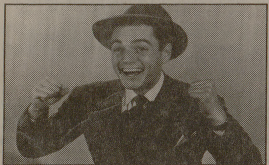
Subject after receiving Citibank Classic Visa Photocard.

photo on one's Student ID.) It's an immediate form of ID, a boost to your self-image. ¶ Of course if your card is ever lost or stolen and a stranger is prevented from using it, you'll feel exceptionally good (showing no signs of Credit Card Theft Nervosa). ¶ Other experts point to specific services, such as The Lost Wallet™ Service that can replace your card usually within 24 hours. Or the 24-Hour Customer Service line, your hotline, if you will, for any card-related anxiety whatsoever. ¶ Further analysis reveals three services that protect the purchases you make on the Citibank