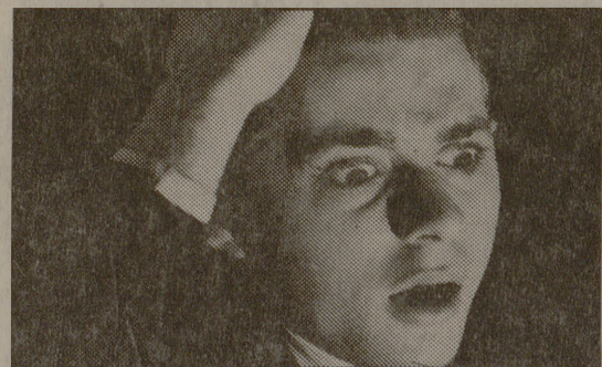
Subject suffering from Credit Card Theft Nervosa.

The Citibank Classic Visa® instills in students feelings of safety, security, and general wellness not unlike those experienced in the womb. Therefore, it is the mother of all credit cards. ¶ Some experts attribute these feelings to the Citibank Photocard , the first credit card with your photo on it. A voice inside says, "This is me, really me." (As opposed to, "Who the heck is that?"—a common response to the