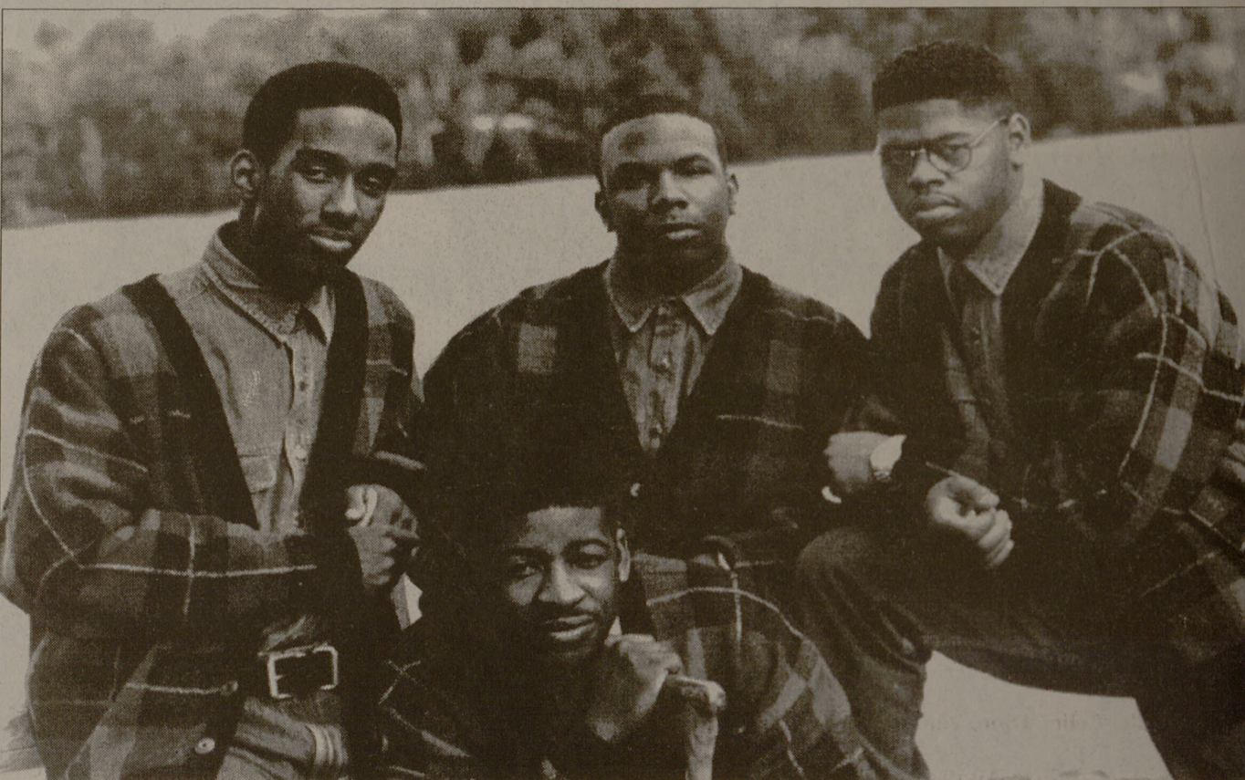
Boyz II Men's "Christmas Interpretations" sounds more like hip hop music than traditional holiday melodies.