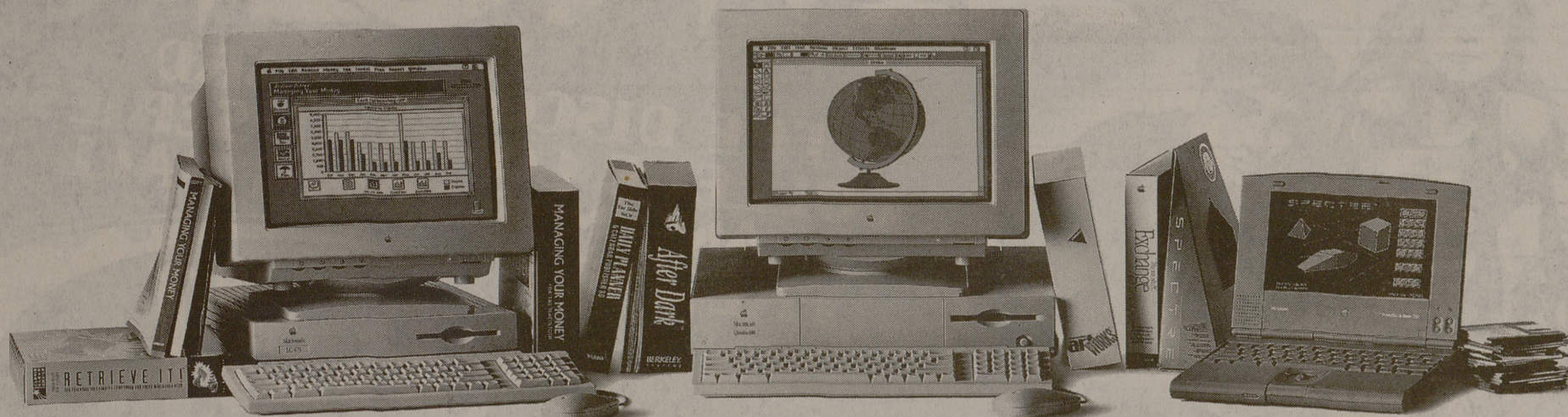
Macintosh LC 475 4/80, Apple Color Plus 14" Display, Apple Keyboard II and mouse.

You're supposed to get a lot out of college, but this is ridiculous.