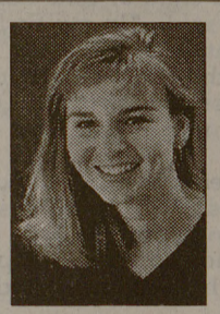
JULIE CHELKOWSKI Sportswriter

Stepping slightly upon the carpet of leaves covering the dark forest floor, the huge buck sifts through bushes and trees in search for a breakfast of berries. His grand set of antlers sits like a crown atop his head, and his white tail adds a touch of contrast to his brown body.