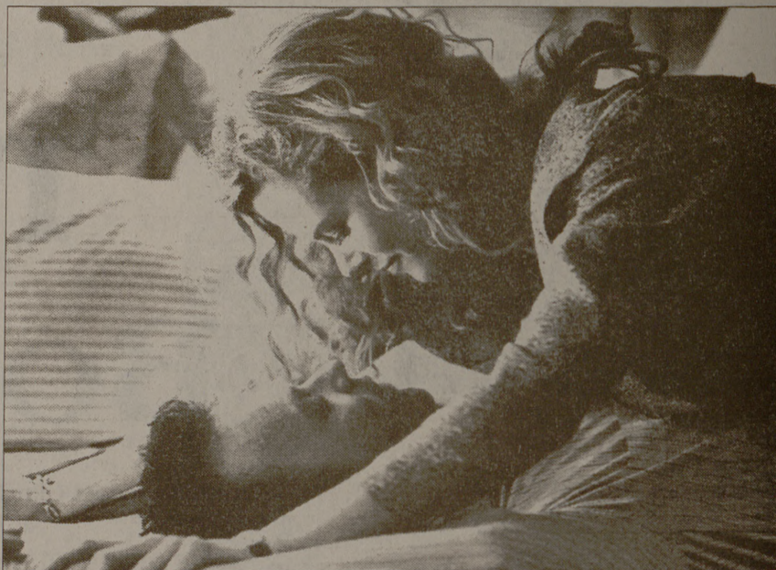
Nicole Kidman and Michael Keaton star in the poignant drama, "My Life."

This dramatic role is one of Keaton's best. From the moment you