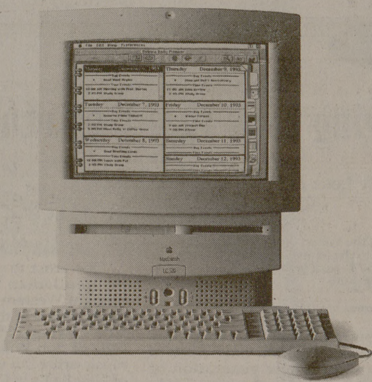
Macintosh LC 520 5/80, internal AppleCD™ 300i CD-ROM Drive, Apple Keyboard II and mouse.

Buy a Macintosh now and you can organize your time, straighten out your finances or go completely ballistic.