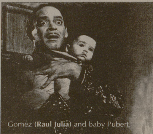
Gomez (Raul Julia) and baby Pubert.

"Addams Family Values" Starring Raul Julia, Anjelica Huston, Joan Cusack and Christopher Lloyd Directed by Barry Sonnenfeld Rated PG-13