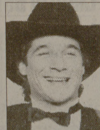
Clint Black will raise money for the Midwest flood victims.

NASHVILLE, Tenn. - A night of dancing, dinner and a celebrity auction will be hosted in Texas by country singer Clint Black and wife Lisa Hartman Black this month to raise money for flood victims in the Midwest.