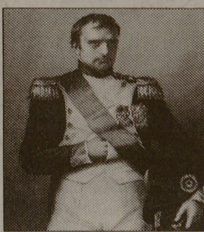
Had Napoleon carried a Citibank Classic Visa card with its Lost Wallet Service , he would not have been compelled to hold on so obsessively to the wallet inside his jacket.

was a sign of advanced intelligence. ¶ The subsequent rise of services was nothing less than an American Revolution. So as you might expect, Citibank would be there for you, even if your card was stolen, or perhaps lost. The Lost Wallet™ Service could have a new card in your hands usually within 24 hours. (You can almost hear Paul Revere crying, "The card is coming! The card is coming!") ¶ When the Great Student Depression came along, Citibank introduced New Deals —special student discounts and savings . Hence, today's student can enjoy a $20 Airfare Discount for domestic flights 1 (ushering in the Jet Age); savings on mail order purchases, sports equipment, magazines and music; a low variable interest rate of 15.4% 2 ; and, no annual fee. ¶ Finally, comes the day you enter the Classical Age (i.e. when you charge your purchases on the Citibank Classic card). You receive Citibank Price Protection to assure you of the best prices. Just see the same item advertised in print for less, within 60 days, and Citibank will refund the difference up to $150 3 . You receive Buyers Security™ , to cover