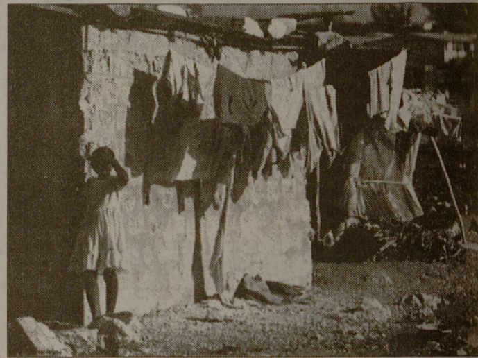
A girl stands outside of her house in the slum area of Cite Soleil, Port-Au-Prince, Haiti on Monday.

spokesman, said army commander Lt. Gen. Raoul Cedras and police chief Lt. Col. Joseph Michel Francois have demanded that Malval include four coup supporters in his Cabinet.