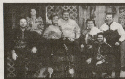
KILT Band From FM 100

★ The Astroarena Fannin at Loop 610 South