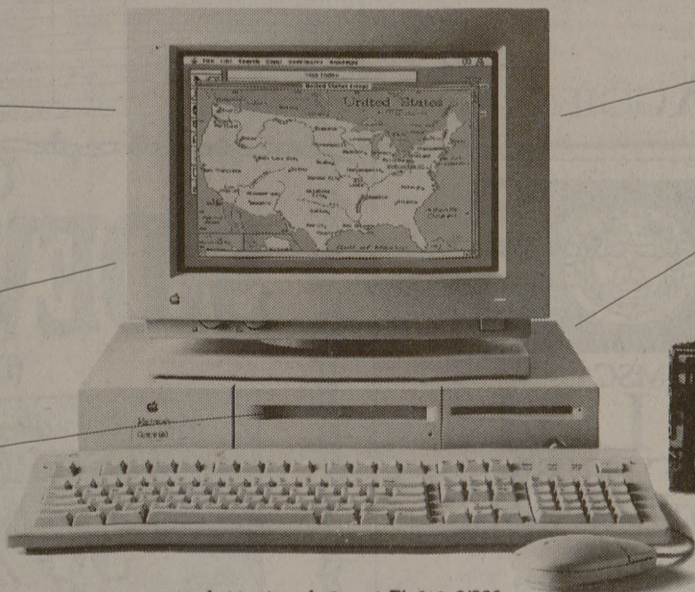
Apple Macintosh Centris™ 610 8/230 with CD-ROM, Macintosh Color Display & Apple Extended Keyboard II.

CD-ROM technology brings vast new capabilities to the desktop. Which is why, soon, more and more computers will include a CD-ROM drive. Buy one, and you're making an investment that will last you well into the future.