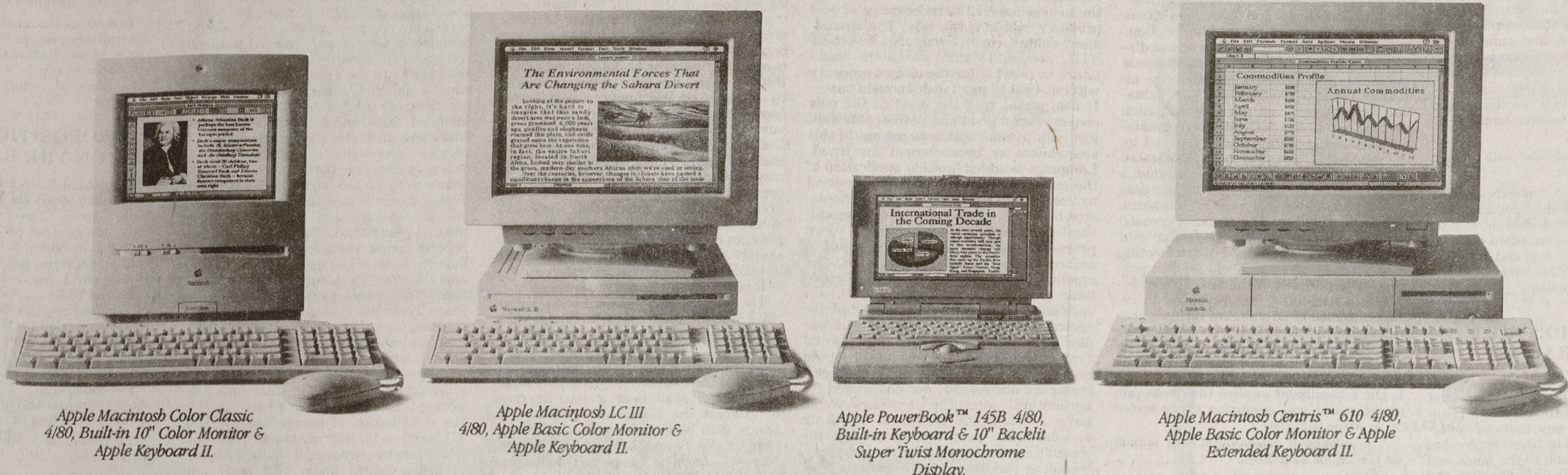
Apple Macintosh Color Classic 4/80, Built-in 10" Color Monitor & Apple Keyboard II.

Not even your local diet center offers reductions like this.