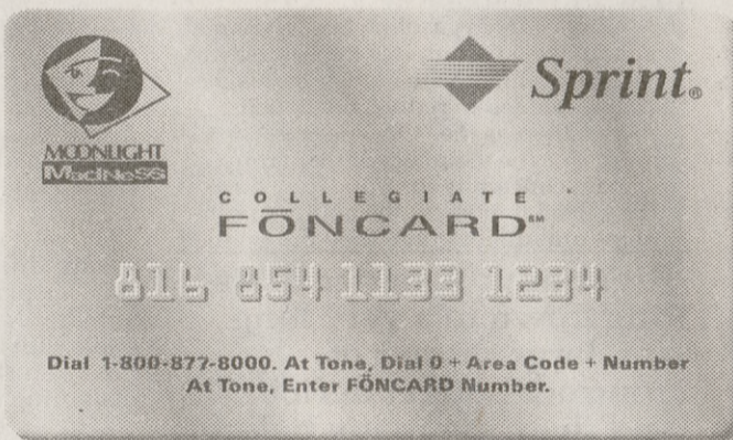
THIS COLLEGIATE FONCARD IS SO EASY, IT'S WEIRD.

Like the COLLEGIATE FONCARD SM from Sprint. At 9¢ a minute, its late night MOONLIGHT MADNESS SM rate is certainly unusual. Not to mention the GREAT STUFF you get just for using your calling card.