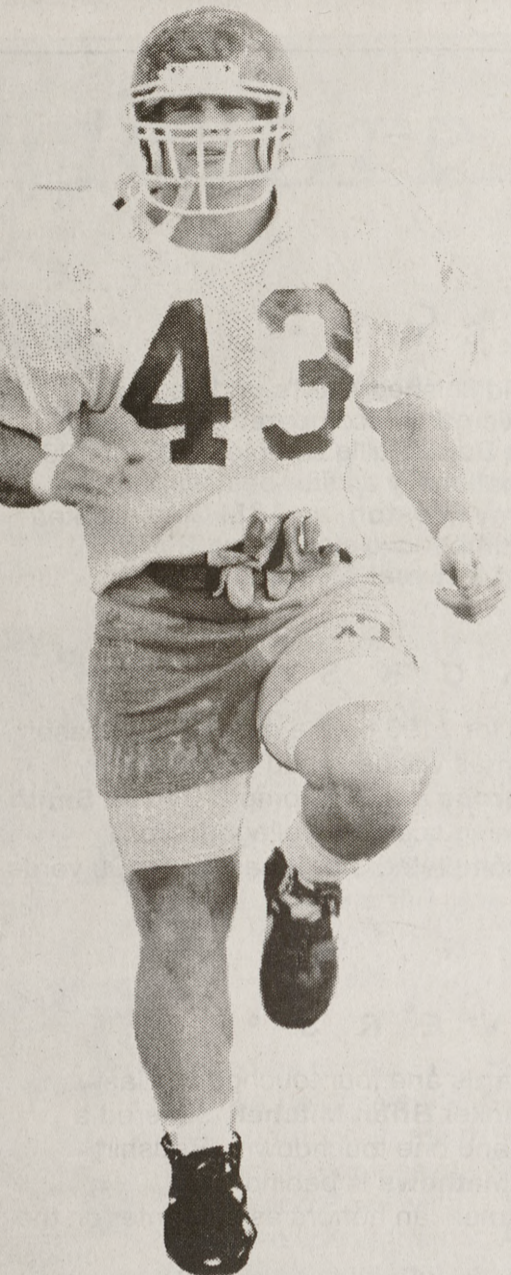
Darrin Hill/The Battalion