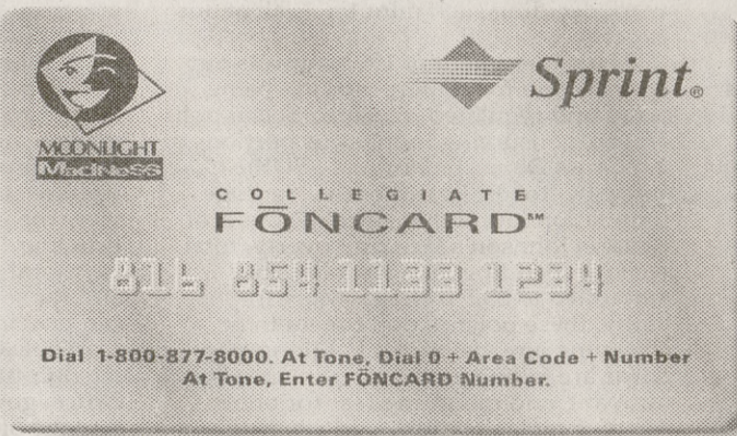
THIS COLLEGIATE FÖNCARD IS SO EASY, IT'S WEIRD.

Like the COLLEGIATE FÖNCARD ™ from Sprint. At 9¢ a minute, its late night MOONLIGHT MADNESS ™ rate is certainly unusual. Not to mention the GREAT STUFF you get just for using your calling card.