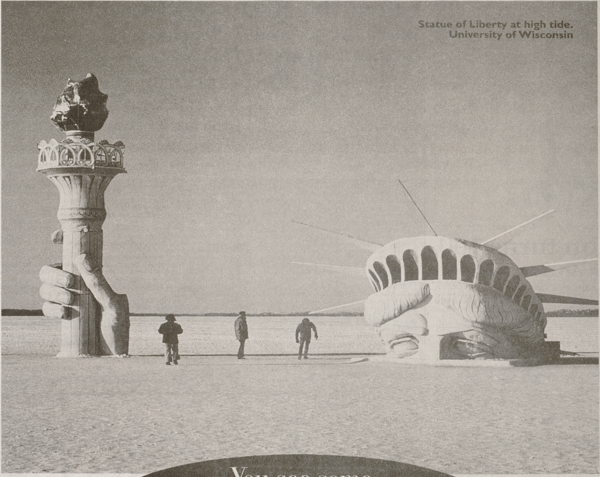
Statue of Liberty at high tide.

STUDENT GOVERNMENT AT THE UNIVERSITY OF WISCONSIN. DEDICATED TO THE PURSUIT OF SILLINESS, THEY IMMEDIATELY