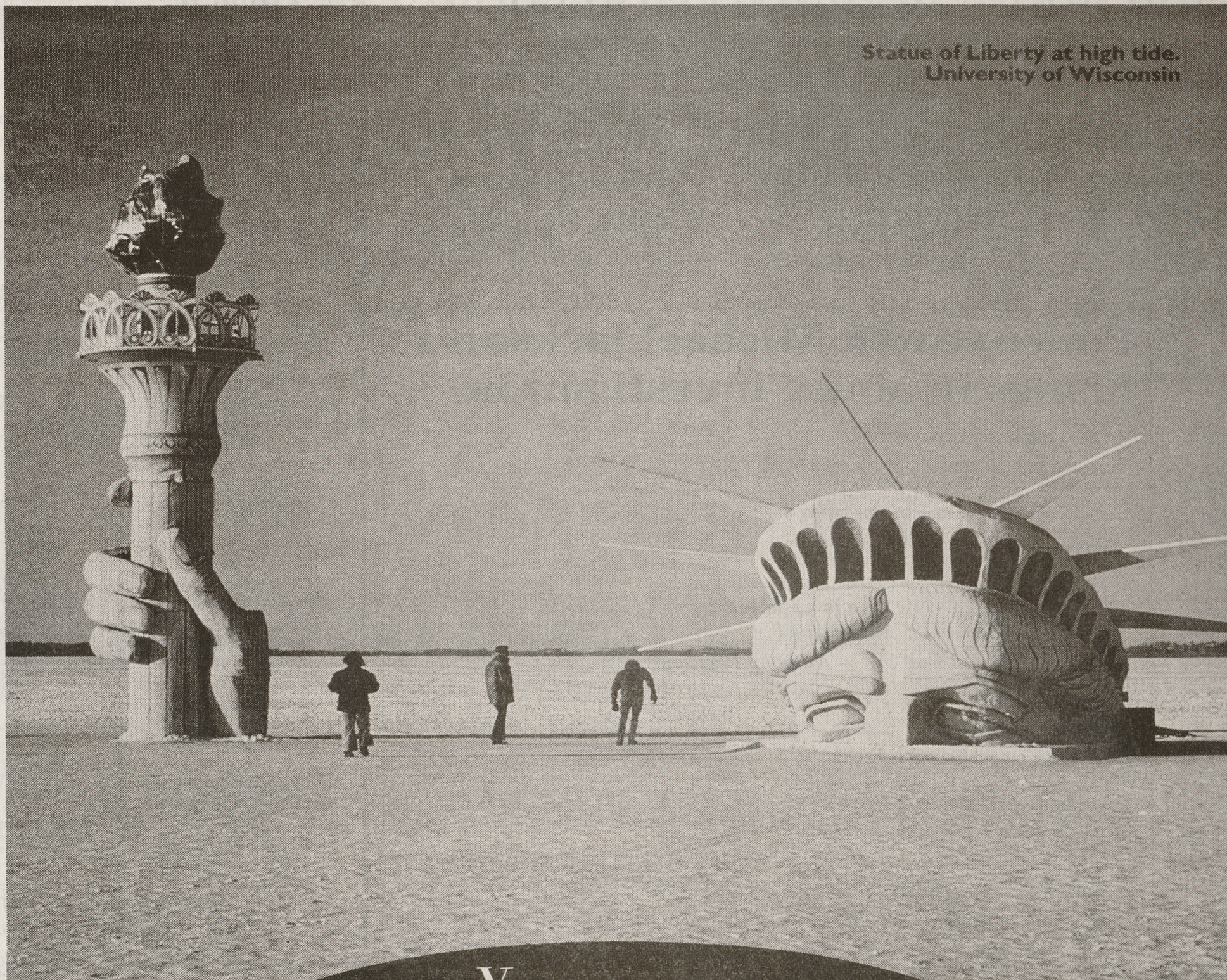
Statue of Liberty at high tide. University of Wisconsin

You see some weird things on college campuses.