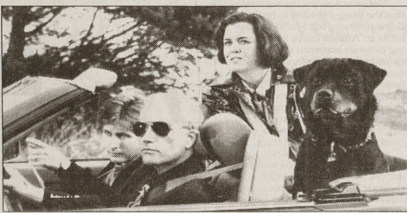
Seattle detectives Bill Reimers (Emilio Estevez, far left) and Chris Leace (Richard Dreyfuss) are back again for "Another Stakeout." But, this time Assistant District Attorney Gina Garrett (Rosie O'Donnell) is tagging along.

Dreyfuss and Estevez are naturals acting together and O'Donnell is great in her part as the incompe-