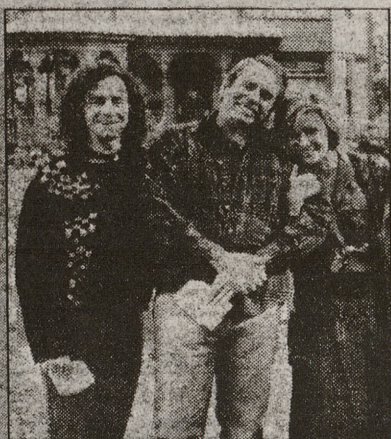
College boy Crawl (Pauly Shore, left) visits his girlfriend's Midwest family. Lane Smith (center) and Cindy Pickett co-star.

Rebecca finds herself in a bind when her high school boyfriend, who she has been stringing along, proposes at the town country club. Crawl comes to her rescue by announcing he and Rebecca are engaged, much to her parents' dismay.