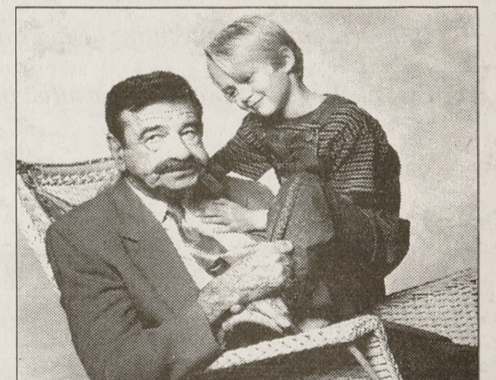
Walter Matthau (right) plays crotchety Mr. Wilson with Mason Gamble as "Dennis the Menace."