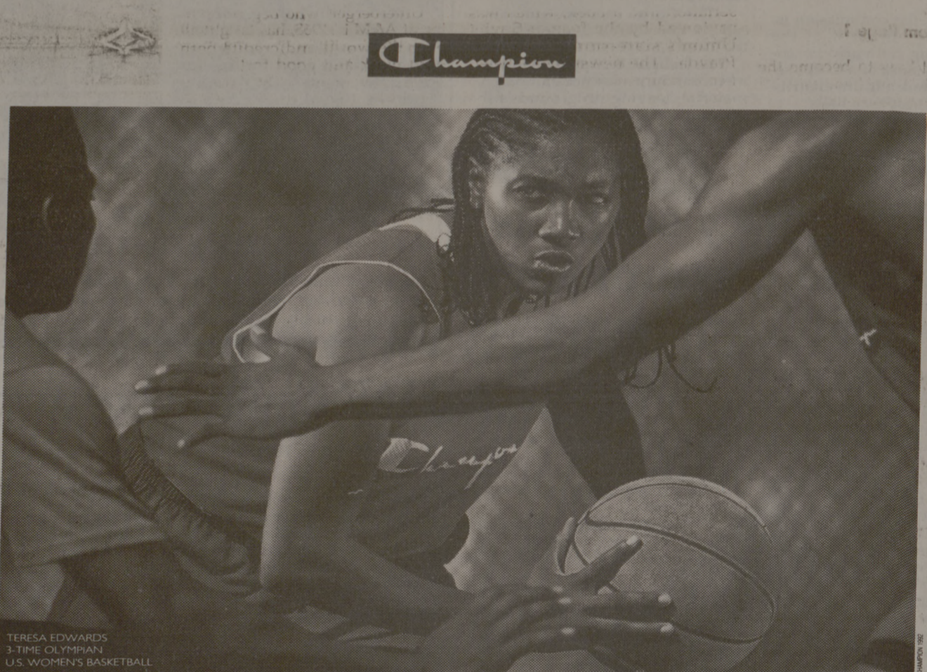
TERESA EDWARDS 3-TIME OLYMPIAN U.S. WOMEN'S BASKETBALL