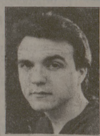
DAVID WINDER Sports Writer