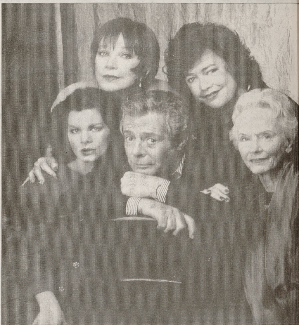
Marcello Mastroianni (center) and (clockwise from upper left) Shirley MacLaine, Kathy Bates, Jessica Tandy and newcomer Marcia Gay Harden star in the comedic drama "Used People."

the fullest detail. The other characters are integral to the action and provide the movie with vital depth, but only as accents to Pearl's story.