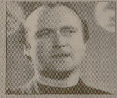
Phil Collins hosted the 1992 Billboard Music Awards show.

ASSOCIATED PRESS LOS ANGELES — Country superstar Garth Brooks won seven trophies Wednesday night at the 1992 Billboard Music Awards, including best pop artist and country singles artist. Phil Collins hosted the two-hour ceremony. Genesis, Arrested Development, Richard Marx and Boyz II Men performed. Winners were based on worldwide record sales, radio airplay and marketplace tallies as compiled by Billboard magazine from Nov. 30, 1991, to Nov. 28 of this year. Michael Jackson was honored with a special award for best-selling artist of the past decade. Billboard's first annual Century Award for distinguished creative achievement was presented to George Harrison. Winners of the 1992 Billboard Music Awards Pop Artist, Garth Brooks. Country Artist, Garth Brooks. Hot 100 Singles Artist, Boyz II Men. Hot Country Singles Artist, Garth Brooks. Billboard 200 Albums Artist, Garth Brooks. Country Albums Artist, Garth Brooks. R&B Artist, Jodeci. R&B Albums Artist, Jodeci. New Pop Artist, Kris Kross. Billboard 200 Albums Group Artist, Guns N' Roses. Hot Adult Contemporary Artist, Richard Marx. Modern Rock Tracks Artist, U2. Hot Rap Singles Artist, Cypress Hill. Billboard 200 Album, "Ropin' the Wind," Garth Brooks. Country Album, "Ropin' the Wind," Garth Brooks. Album Rock Track, "Mysterious Ways," U2. Album Rock Tracks Artist, U2. Modern Rock Track, "One," U2. R&B Album, "Forever My Lady," Jodeci. Worldwide Album, "Dangerous," Michael Jackson.