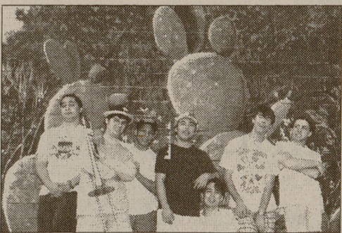
The Gingbreadmen will play tonight at a post-election party at Stafford Opera House.

Most of the band members were friends at William Howard Taft High School, and played in the marching and jazz bands as well as talent shows and garage bands.