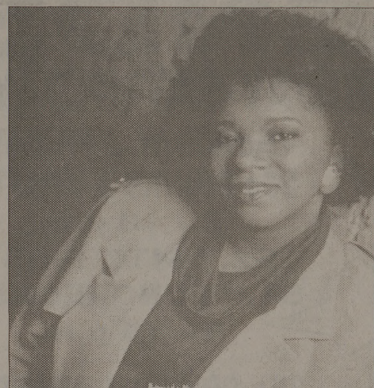
Christian singer Babbie Mason.

Mason writes on a variety of topics, many of which reflect her background.