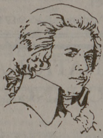
RONDOLETTA Wolfgang A. Mozart