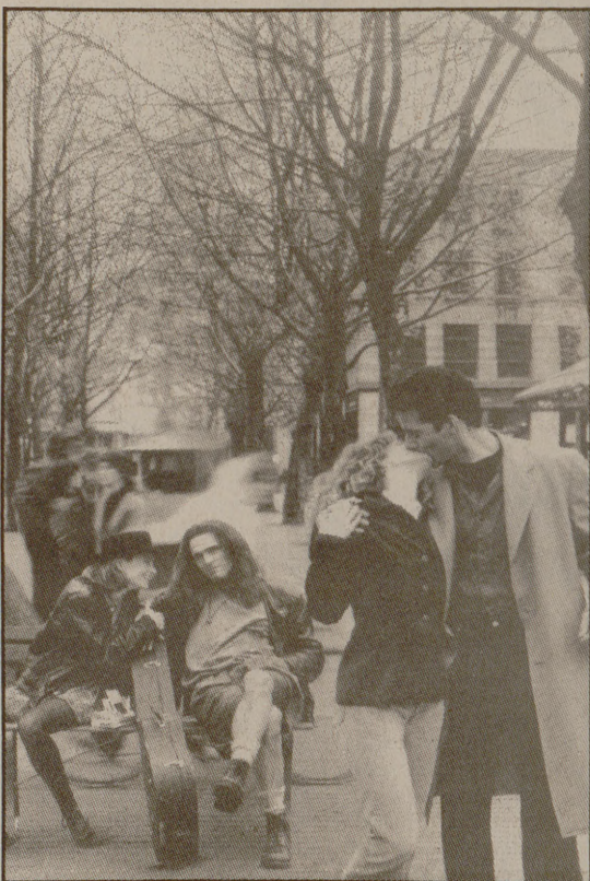
"Singles" motion picture soundtrack.