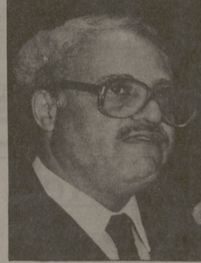
Dr. Benjamin Hooks, national leader of NAACP, "outrageous, a mockery of justice," but he appealed to blacks that "the decision be met with calmness."