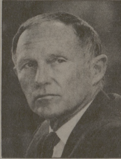
Daryl Gates, L.A. police chief during, was forced to resign. Gates and other city authorities allocated $1 million to quell possible riots at not-guilty verdict.