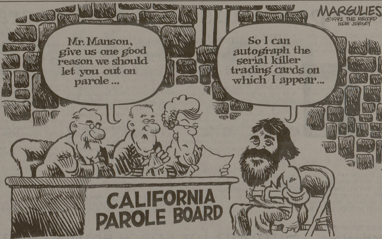
MARGULIES ©1992 THE RECORD NEW JERSEY

The following opinions are a consensus of The Battalion opinion staff and senior editors.