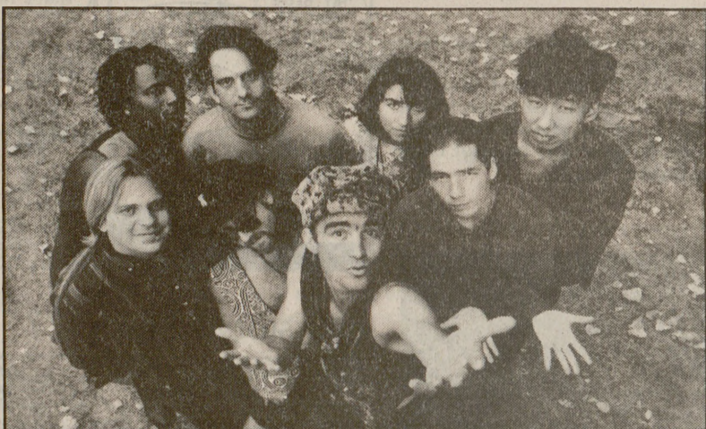
Austin's Poi Dog Pondering features their plethora of instruments tonight at the Stafford Opera House.

aren't sure about the show tomorrow night, stop by Marooned Records this afternoon for the in-store performance. Their set there should convince you to make it to the show, but make sure you take some cash - you'll have to get the new disc.