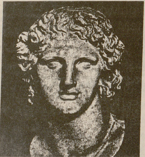
ALEXANDER THE GREAT

They say I was the most brilliant general in history.