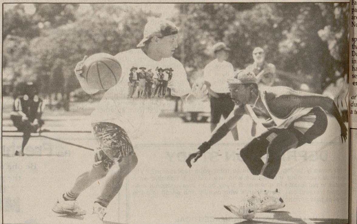
Billy Hoyle (Woody Harrelson), l. goes up against Sidney Deane (Wesley Snipes) in a game of one-on-one in the surprising funny "White Men Can't Jump."

Hoyle's girlfriend Gloria Clemente (Rosie Perez) thinks the answer to their financial problems