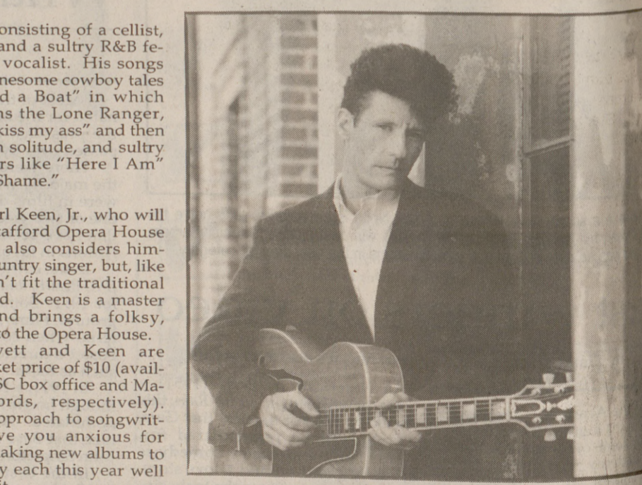
Lyle Lovett plays Rudder Auditorium Monday night.