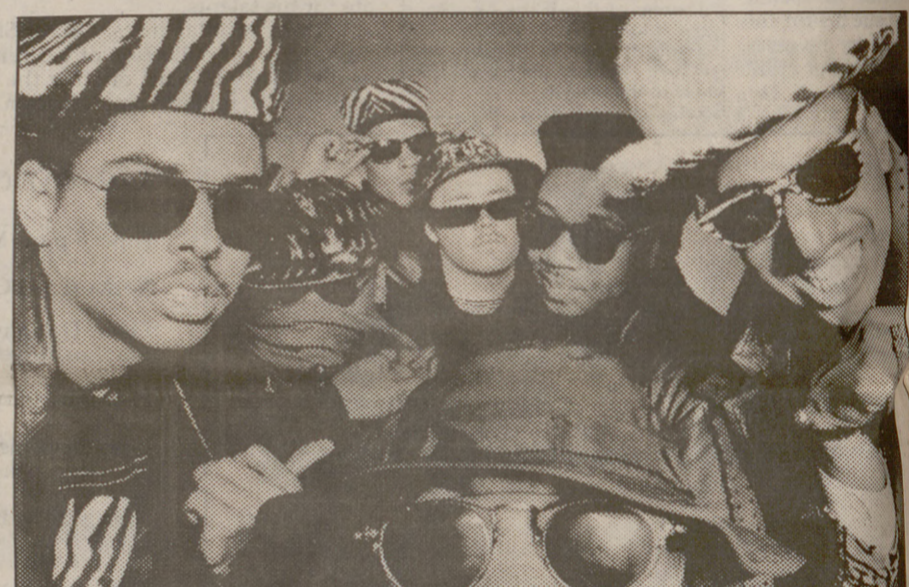
MSC Town Hall hosts Digital Underground tomorrow night at Deware Field House.