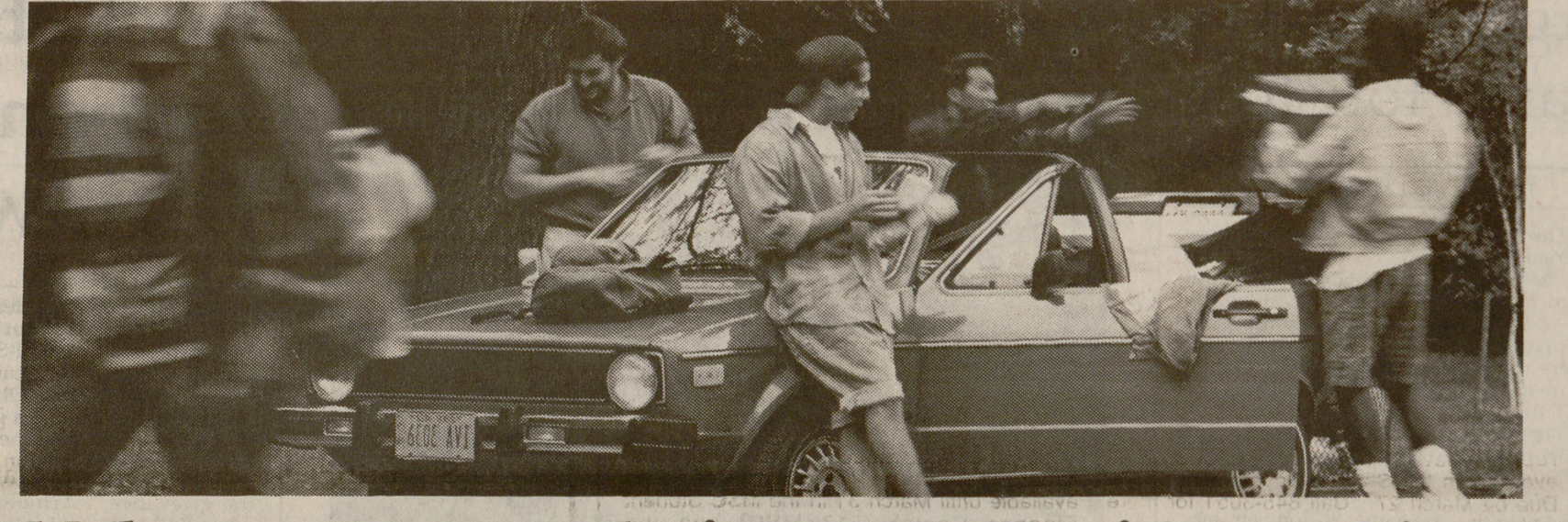
Make sure your road trip proceeds without a hitch.

Some of the fans had been at No. 19 in the nation during regular season, but four w the airport for two hours, first later were dropped from rankings after back-to-back lo arriving to greet another area team that is headed for the Sweet to New Mexico and Air Force. 16, New Mexico State which defeated Southwestern Louisiana their past 10 games, they ne returned to the national ranki