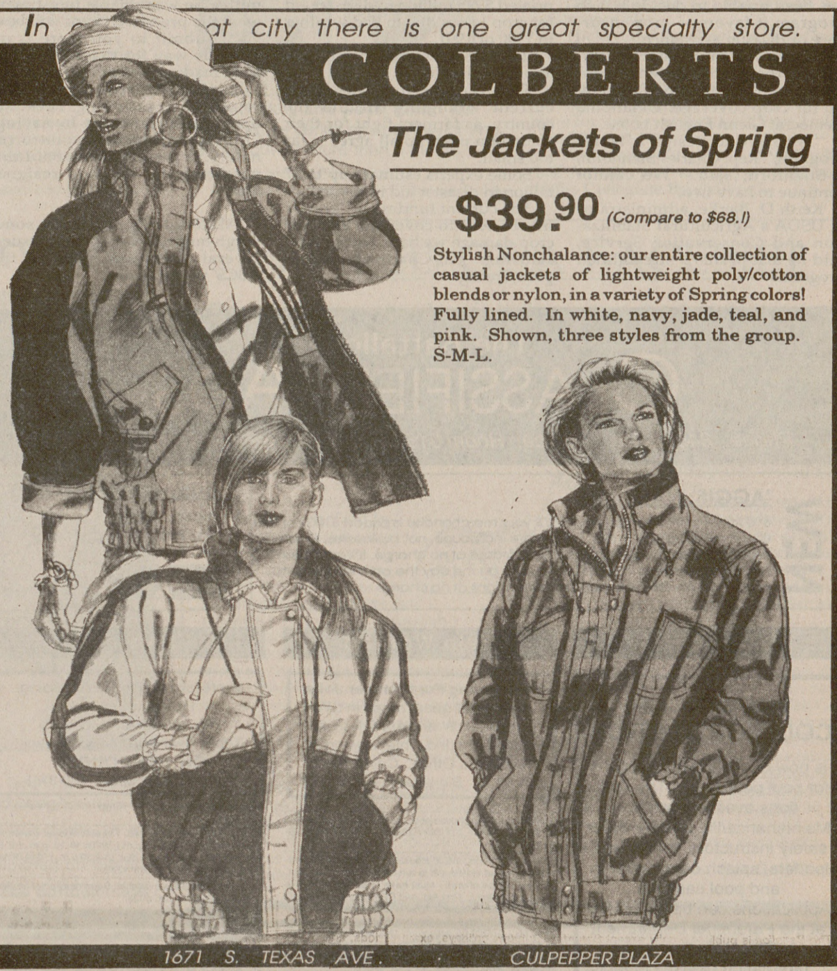
1671 S. TEXAS AVE.

Stylish Nonchalance: our entire collection of casual jackets of lightweight poly/cotton blends or nylon, in a variety of Spring colors! Fully lined. In white, navy, jade, teal, and pink. Shown, three styles from the group. S-M-L.