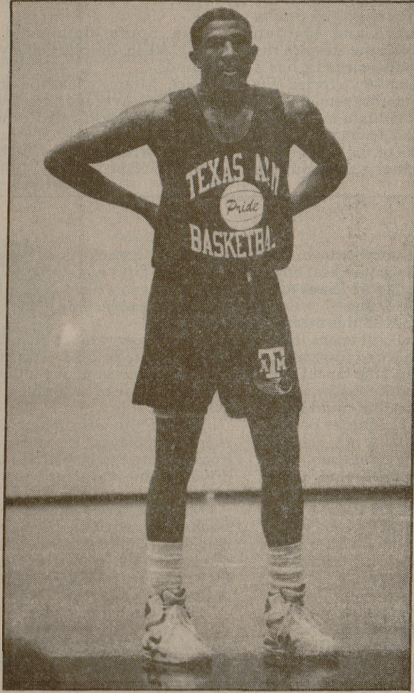
KARL STOLLEIS/The Battalion