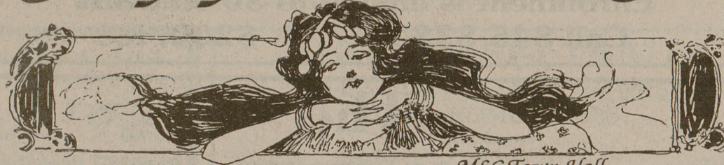
MSC Town Hall

Experience a night dripping with creativity and excitement.