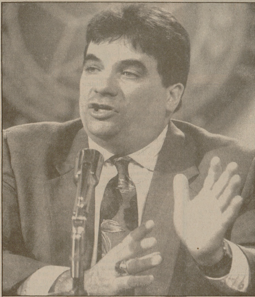
Battalion file photo

The University is still awaiting an NCAA judgement concerning 10 rules violations that occurred in the program under Davis'.