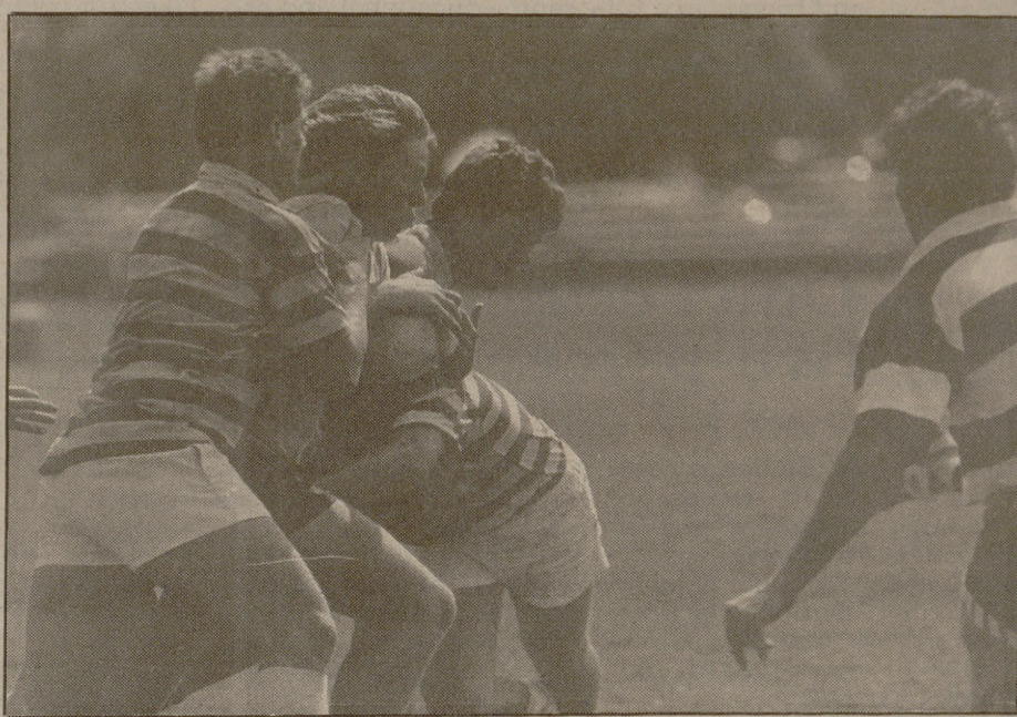
Come join the excitement of Rugby this weekend at the Zachry Rugby Field as the Men's Rugby Team competes against Houston. The game begins at 2 p.m.