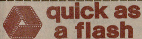
Photo Lab & Portrait Studio 2 FOR 1 PRINTS

VALID THRU OCT. 31, '91 WITH A&M I.D. CANNOT BE USED WITH ANY OTHER SPECIAL DISCOUNT.