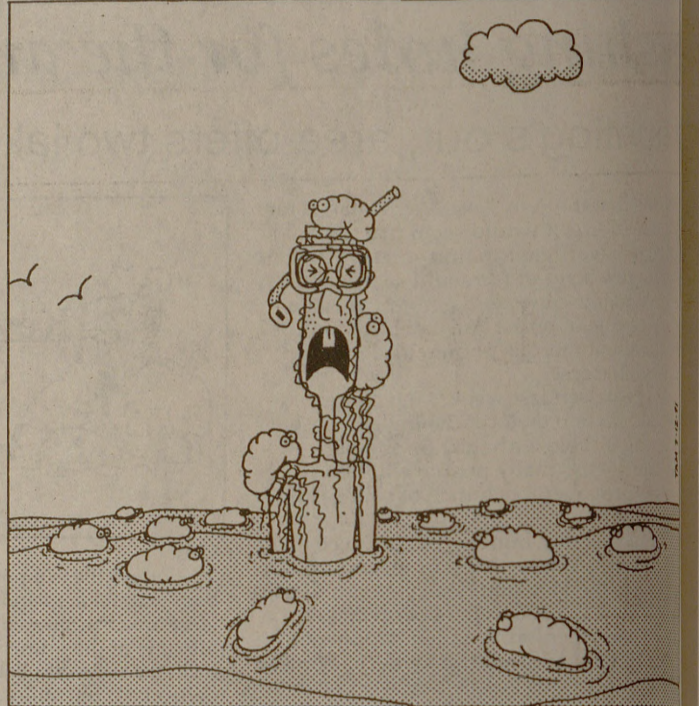
HERBERT PICKS THE WRONG DAY TO GO SNORKELING