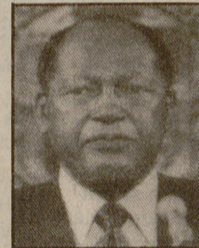
Mayor Tom Bradley

LOS ANGELES (AP) — The Police Department needs to replace Chief Daryl Gates as part of an overhaul to curb brutality and racism and to keep it from slipping into a "siege mentality," a special commission recommended Tuesday.