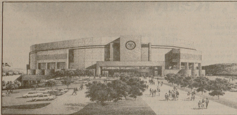
The proposed Texas A&M Special Events Center, shown in this architect's conception, should boost the local economy as well as being beautiful.

EDITOR'S NOTE: This is the second of a two-part series on A&M's Special Events Center.