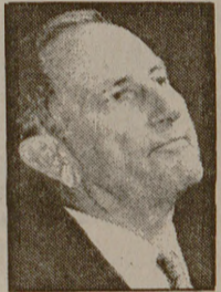
Clayton Williams Jr. that supported Williams exclusively before the election came through with contributions after Richards was elected in November, according to a copyright story in Sunday editions of the Dallas Morning News.

DALLAS (AP) — Dozens of supporters who helped Republican Clayton Williams outspend Democrat Ann Richards gave her more than $148,000 shortly after she was elected governor, a newspaper reported. At least 60 donors — both individuals and political action committees — that supported Williams exclusively before the election came through with contributions after Richards was elected in November, according to a copyright story in Sunday editions of the Dallas Morning News.