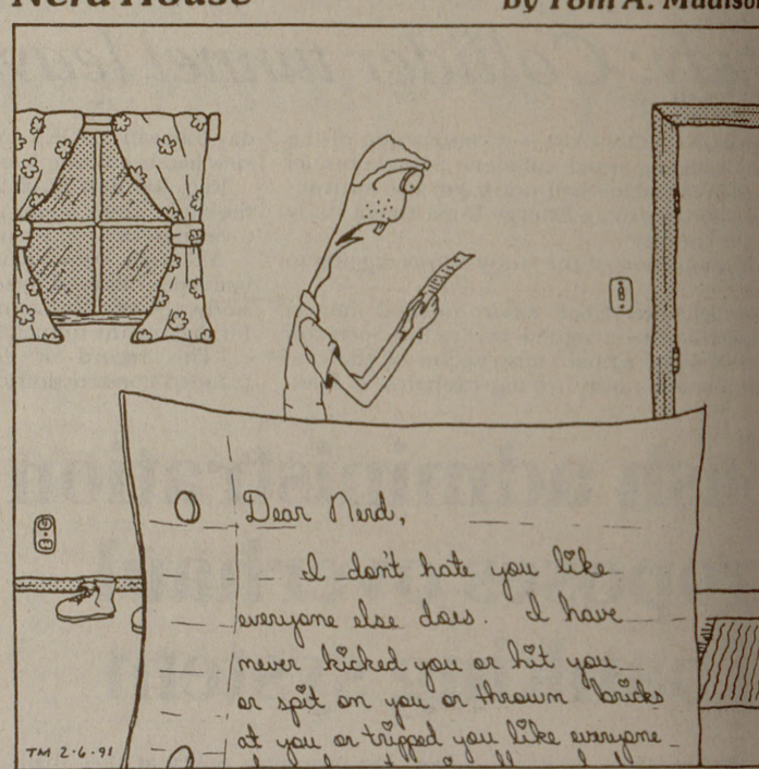
HERBERT GETS A LOVE LETTER.